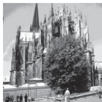
The main feature of Cologne – The Domo which took 400 years to build